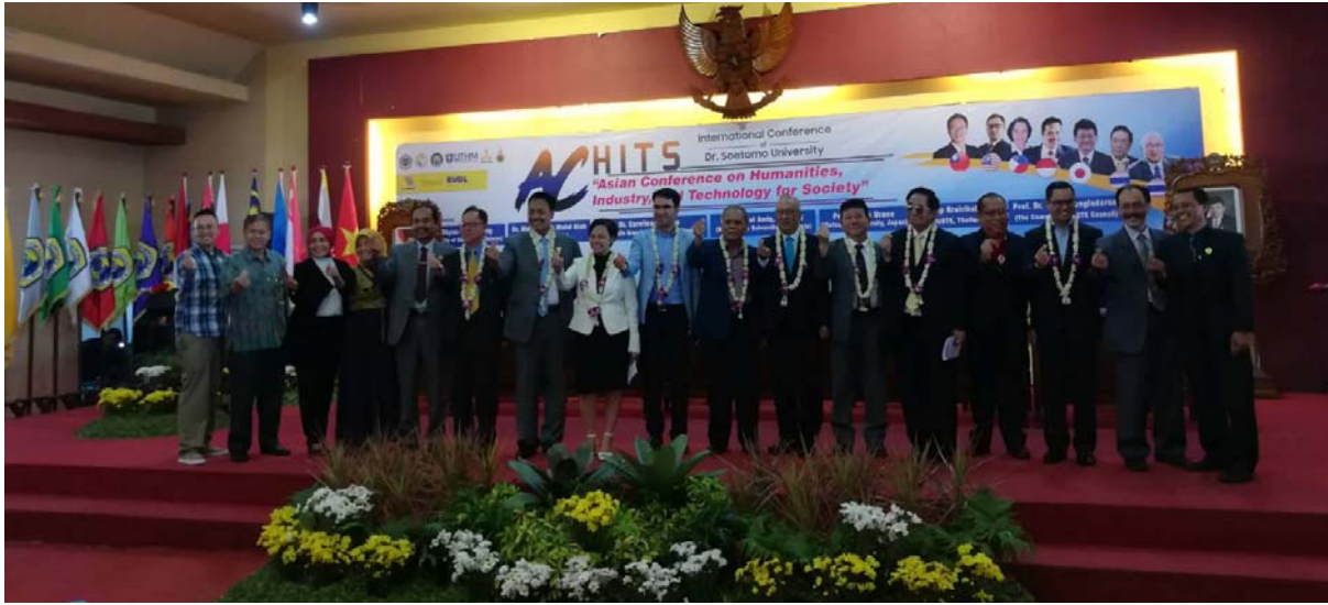
Group Photo at the ASEAN Conference on Humanities Industries, and Technology for Society organized by Dr. Soetomo University in the Republic of Indonesia