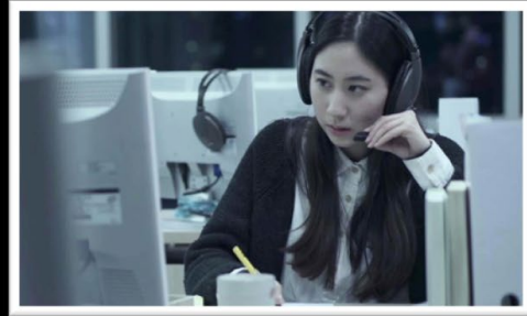
Another is an emergency hot-line operator .